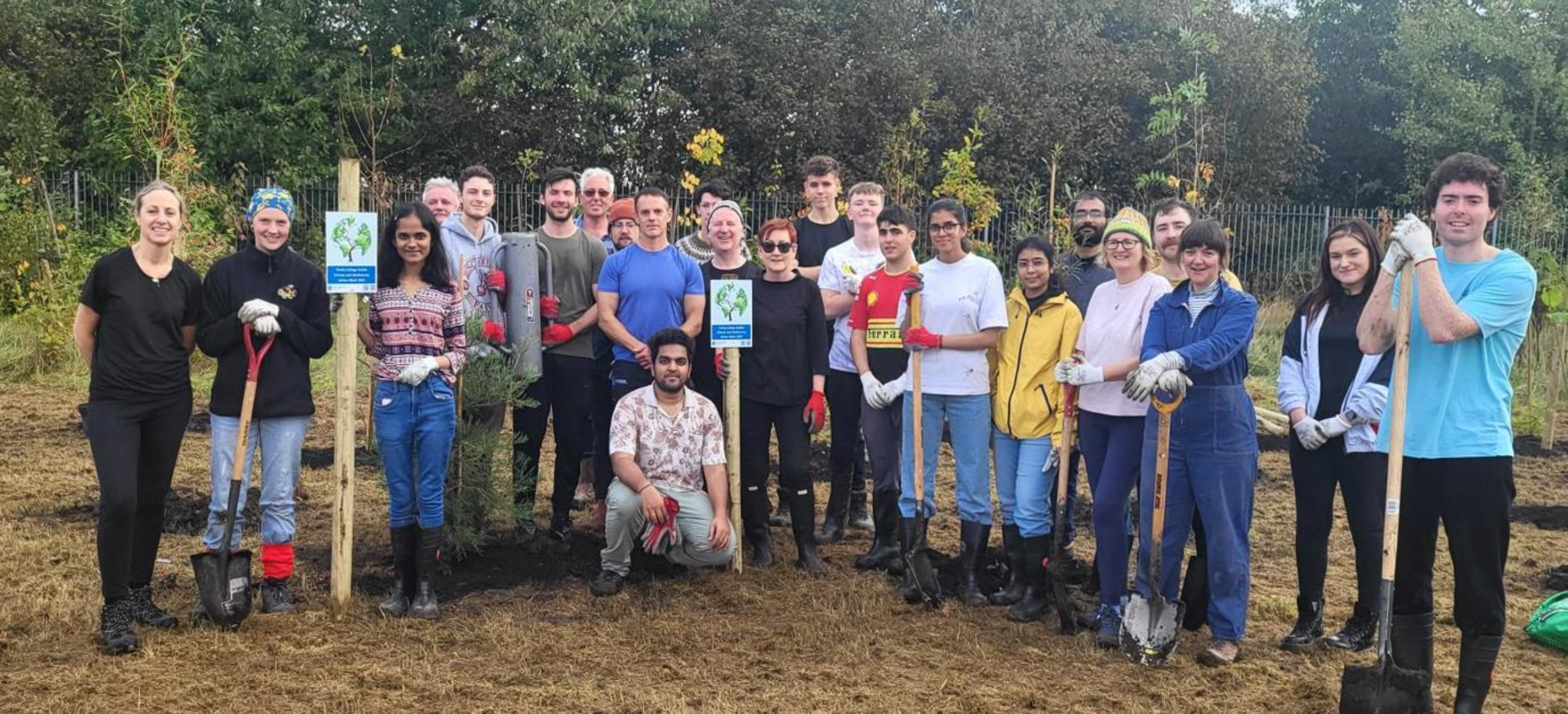
Annual Tree Planting Event Wednesday 15 th October 2025